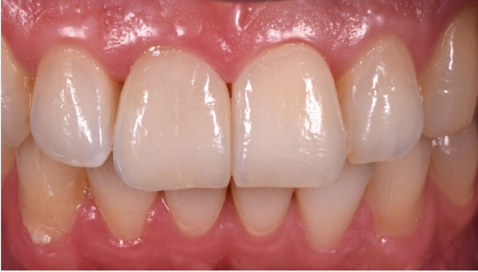
Veneer on right central incisor

Zahntechnik Düsseldorf, Rebbe. Thielen. Joit. GmbH, Düsseldorf, Germany